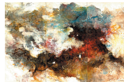
红土地 Red land 墨, 油彩, 宣纸, 布面 Ink, oil on rice paper and canvas 138cm x 207cm 2014年