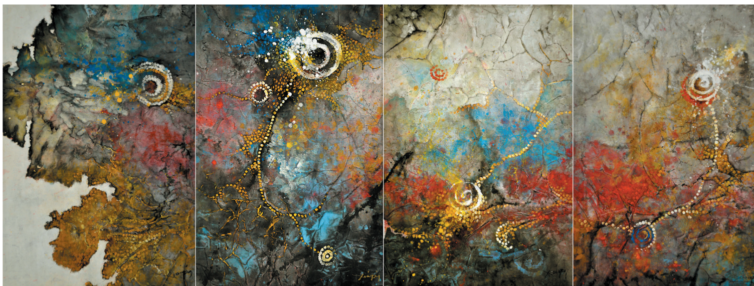
水洼 Waterhole 墨, 油彩, 宣纸, 布面 Ink, oil on rice paper and canvas 100cm x 272cm 2017年