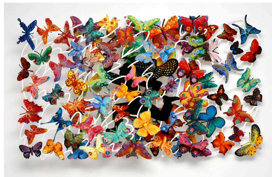
Beauty Hunter 捕捉美丽 wall installation 墙面装置 metal 金属 250cm×148cm 2016

"LAYERS" is David Gerstein's first large-scale solo exhibition in a China museum. It features wall sculptures, indoor free-standing sculptures and outdoor sculptures that were created by the artist in the last decade, alongside paintings representing his entire career.