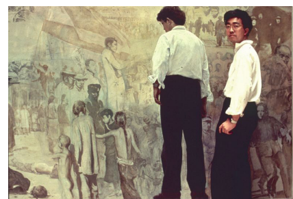
陈逸飞在画前 Chen Yifei in front of his painting 摄影 photograph 1980年