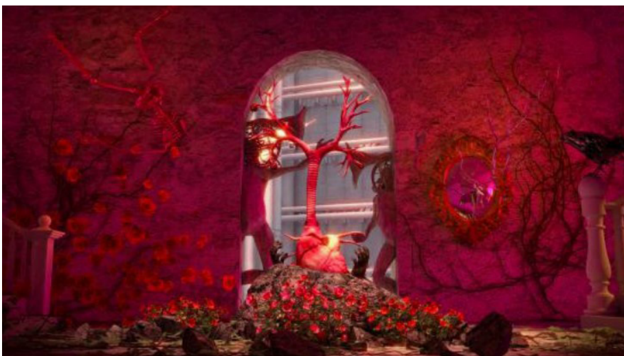
田晓磊 Xiaolei Tian 诗歌 Poetry 7' 13" 单屏动画 Single-screen animation 2014年