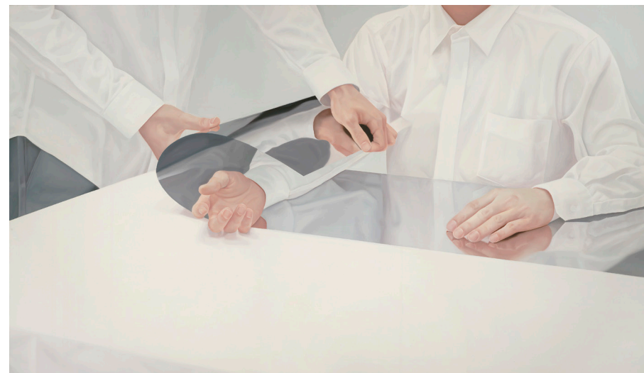
梁浩 Hao Liang 映像 Image 布面油画 Oil on canvas 110cm×190cm 2016年

Location: 3/F and 4/F Exhibition Hall of Building No.1, Today Art Museum