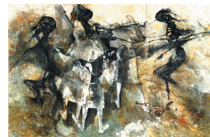
神圣的黑色 (4) 墨, 油彩, 宣纸, 布面 Ink, oil on rice paper and canvas 137cm x 208cm 2016年