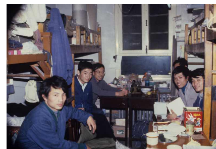
中央美院宿舍 CAFA accommodation 摄影 photograph 1979年

Location: 3/F and 4/F Exhibition Hall of Building No.1, Today Art Museum