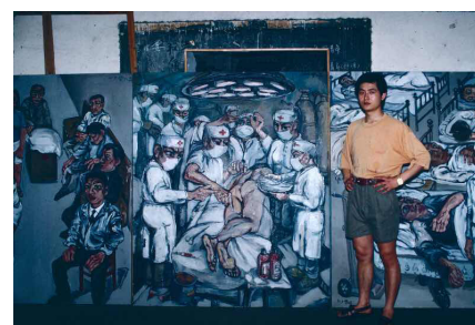
91年的曾梵志 Zeng Fanzhi in 1991 摄影 photograph 1991年

科恩夫人 (Joan Lebold Cohen) 在 79 - 81 年间以及后来数年中为研究中国当代艺术拍摄了大量的中国艺术家为主的照片万余张。本展览精选 150 幅左右, 表现出她和中国艺术家交流的一个个生动的瞬间。这些帮助我们回忆了历史的图片无疑是关于中国当代艺术初期的珍贵资料。